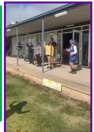
Students warming up doing the Health Hustle